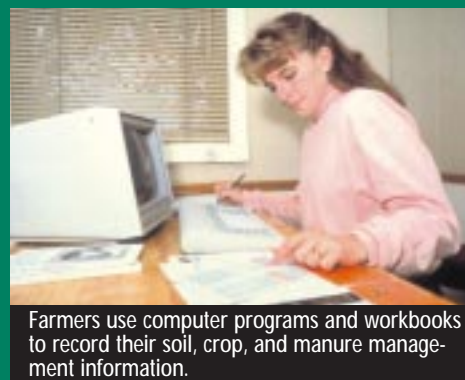
Farmers use computer programs and workbooks to record their soil, crop, and manure management information.

Manure pits hold more than just manure. You may find this surprising, but when pigs drink they are not always neat! Some water spills into the manure pits below. Farmers work hard to clean their barns to reduce odours and keep their pigs healthy. Pens are washed before any new pigs are moved in. Wash water also ends up in the manure storage, which makes the total of manure and water an average of seven (7) litres per pig per day 2 .