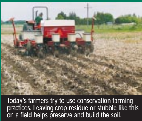
Today's farmers try to use conservation farming practices. Leaving crop residue or stubble like this on a field helps preserve and build the soil.

Canadian farm practices are subject to a variety of federal, provincial and municipal laws, on topics such as: water and environmental protection, normal farm practices, and land use planning. If a farmer is guilty of contaminating a water source, they can be charged just like anyone else.