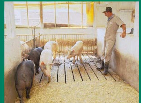
Many barns have slatted floors. Manure and water fall through and into the storage below.

Why would farmers build a storage that holds eight months of manure? The best time to spread manure is when the plants need nutrients the most. Farms should have enough storage to keep manure over the winter so they can spread it when it's needed and at the most environmentally friendly time.