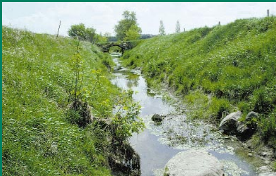
Farmers help keep waterways healthy by maintaining plants and trees along the banks. This is called a buffer strip which prevents soil erosion.

Farming is a perfect combination of science, practical experience and common sense. There are many books and educational programs available for farmers on environmental stewardship practices such as preserving water quality, restoring streams, and reducing odours.